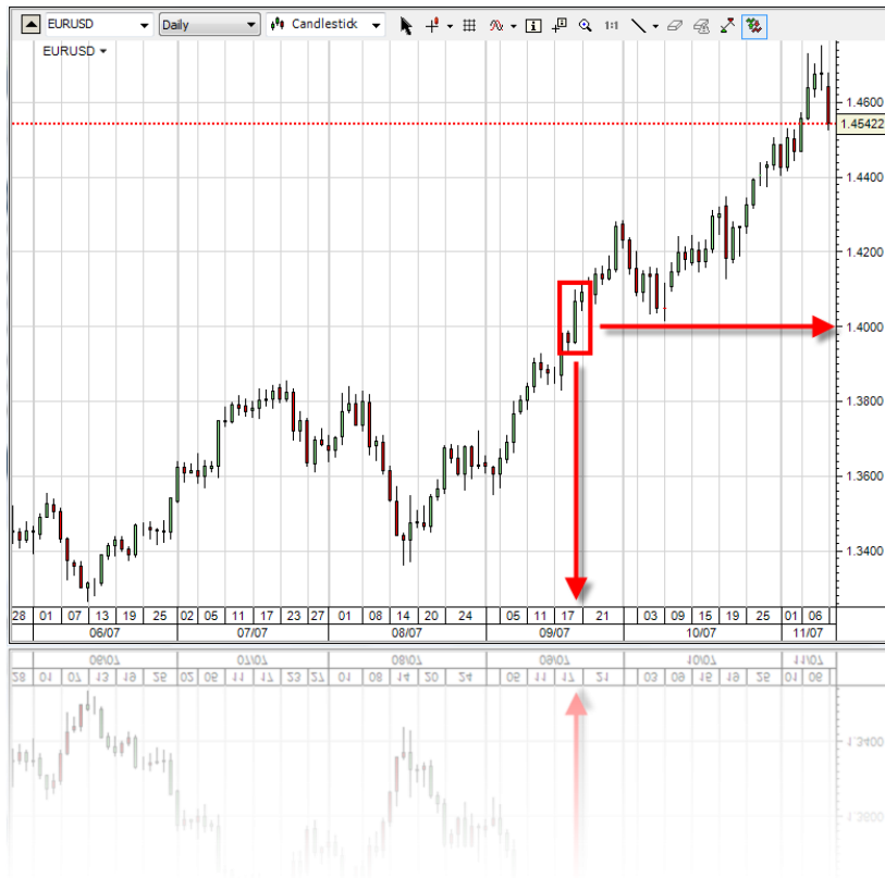
CHART TIME FRAMES

Saxo Bank forex charts give you the ability to analyze the price movement of your favorite currency pair anywhere from a minute-by-minute basis to a month-by-month basis. You have the flexibility to choose which time frame is best for you.